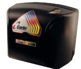
▲ Carlin EZ Gas