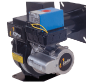
▲ Carlin EZ Oil Burner