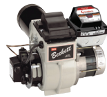
▲ Beckett AFG Oil Burner