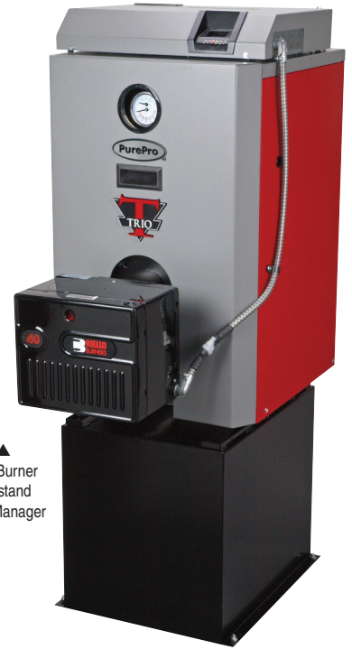
Shown with ▲ Riello F5 Oil Burner with optional stand and Energy Manager Plus II