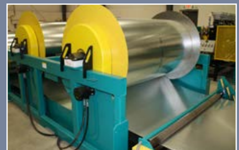
Sophisticated production machinery for ductwork