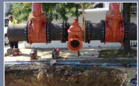
Fabrication services at UL-classified Water Works facility