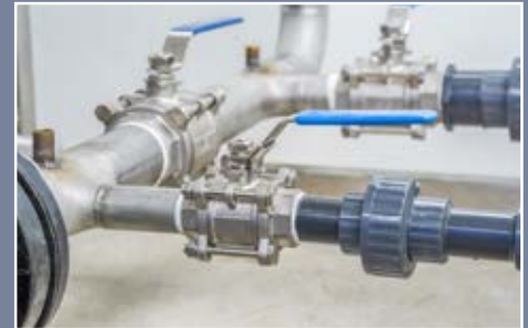
Extensive inventory of PVF