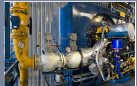
Exclusive distributor of Armstrong steam products in most of Northeast